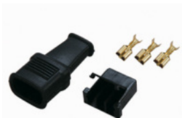
Neuspeed Connector Conversion Kit for 3 Pole Fan Switch P/N# 8.104

To Install the Neuspeed 3 Pole fan switch on a VAG engine vehicle you will need to wire up the 'Adapter Kit' using the Original wiring to the Standard Fan Switch loom in the Sequence as follows.