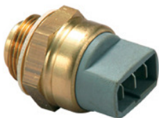
Neuspeed 180°F 3 Pole Fan Switch P/N# 8.170.03